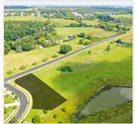
Dark shading represents approximate location of lots